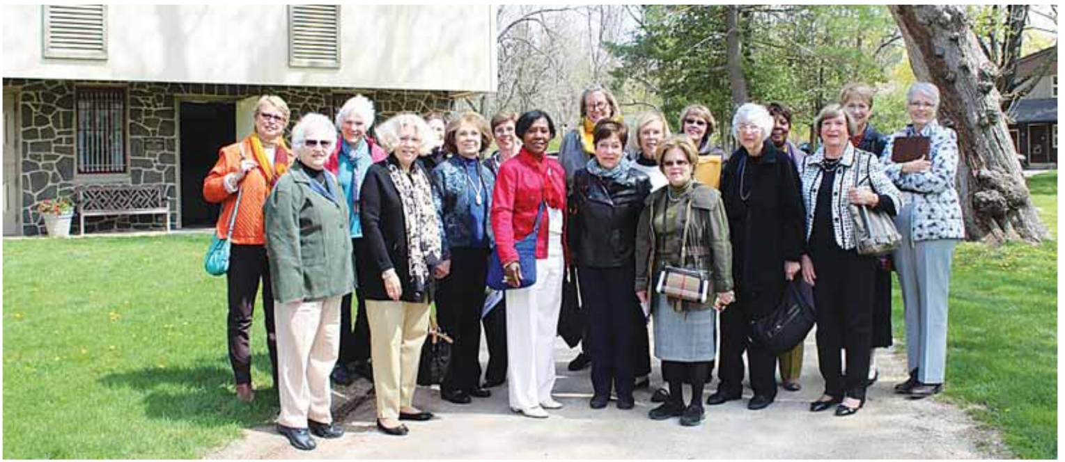
The Fairmount Park Guides visited Historic Waynesborough in May.