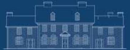
Historic Waynesborough 1724

Philadelphia Society for the Preservation of Landmarks