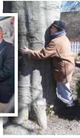
From snowplowing to VIP tours, our Site Managers are ready to handle whatever the day brings!