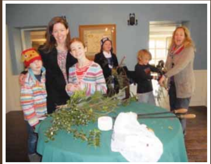
Historic Waynesborough Annual Greens Sale—Anthony Wayne Chapter of the Children of the American Revolution help gather and bundle greens.