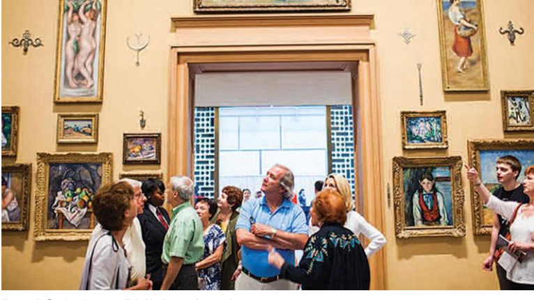
Road Scholar at PhilaLandmarks Number of programs: 61 Number of attendees: 1,140