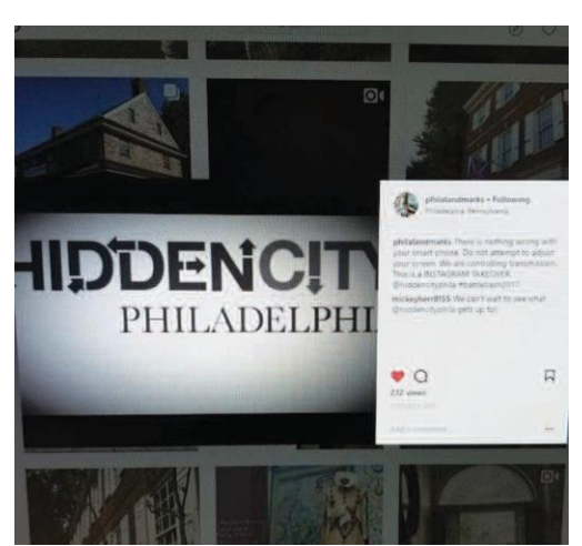
Hidden City Philadelphia Instagram Takeover: It's nice to have friends with 44K followers!

Overall average 30% increase in engagement across all social media platforms.