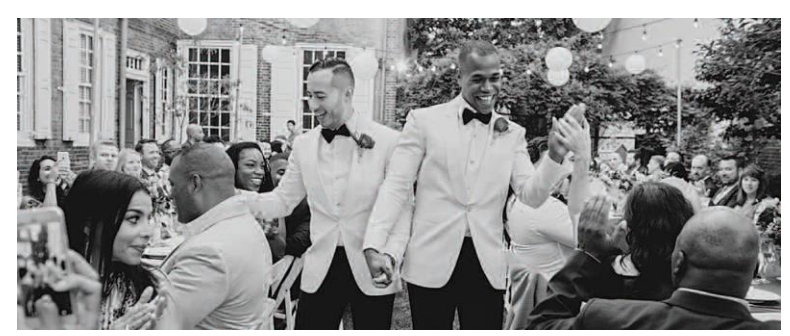
Private Event Rentals: 29 Wedding Rentals: 81