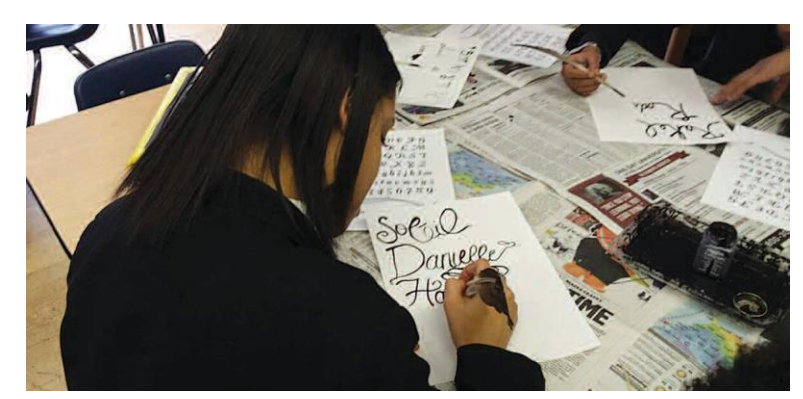
Grumblethorpe Elementary Education Program Number of classes held: 185 (on- and off-site) Number of students served: 1,488