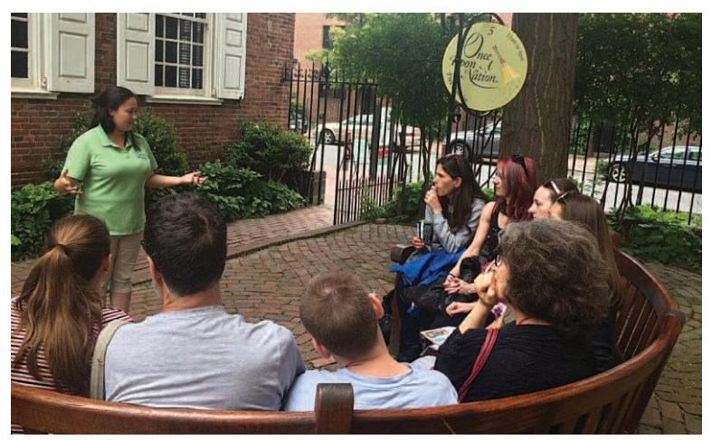
Once Upon a Nation Story Telling Bench at Powel (Memorial-Labor Day Weekend) Visitors: approximately 5,000