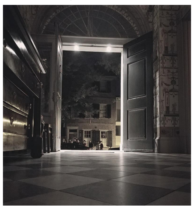
Ghosts of the Mansion Tour (with Ghost Tours of Philadelphia) Attendees: 762